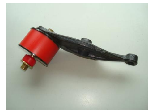
Mount on Bracket